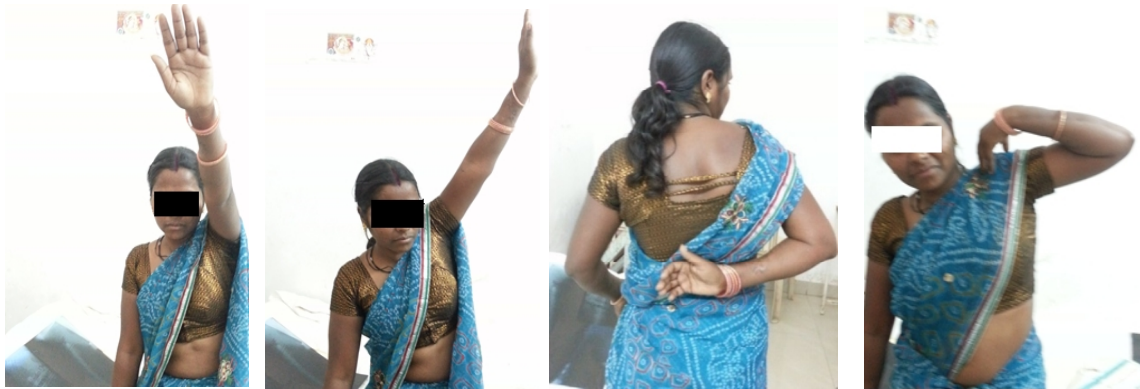
Figure 2 : 28 year old female fracture left humerus A-O type 12.B2 treated with Interlock nailing. Functional Result at Final Follow up.