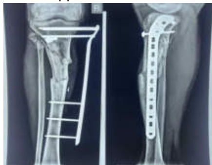
Figure-4 Post operative X-ray