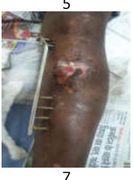
Figure-5 Pre op x ray, Figure-6 Post op xray Figure 7- Follow up