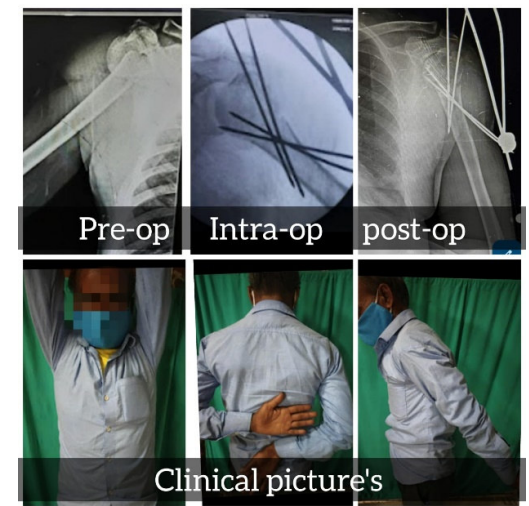
Figure 3-Case 3