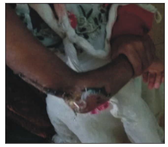
Figure 4 : Postoperative cilical picture of elbow with skin grafting in second case

recognition and decision. Due to collateral circulation sometimes it is difficult to assess exact warm and cold status of limb and capillary refill. We used pulse oximeter to assess ischaemia of the limb that gives a quantitative value of oxygen saturation and helps in taking decision of early