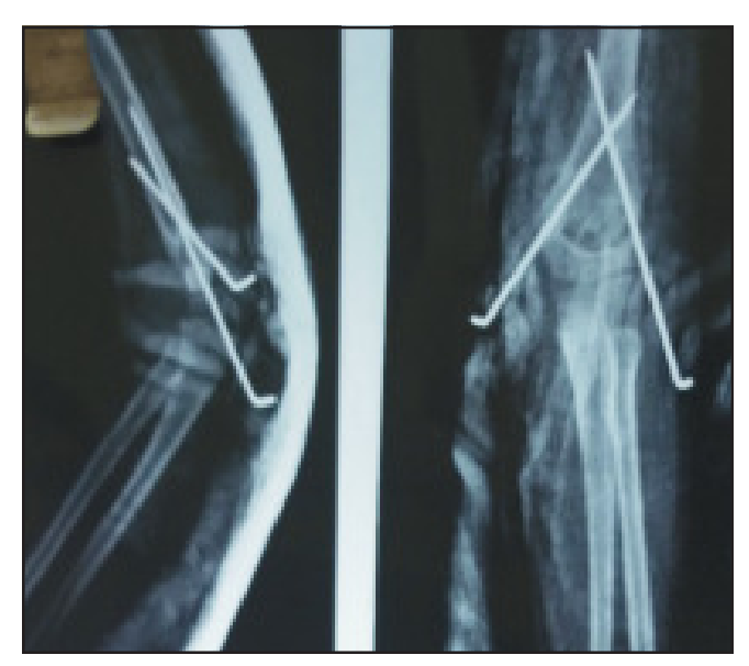
Figure 2 : Postoperative skiagram of fracture supracondylar humerus